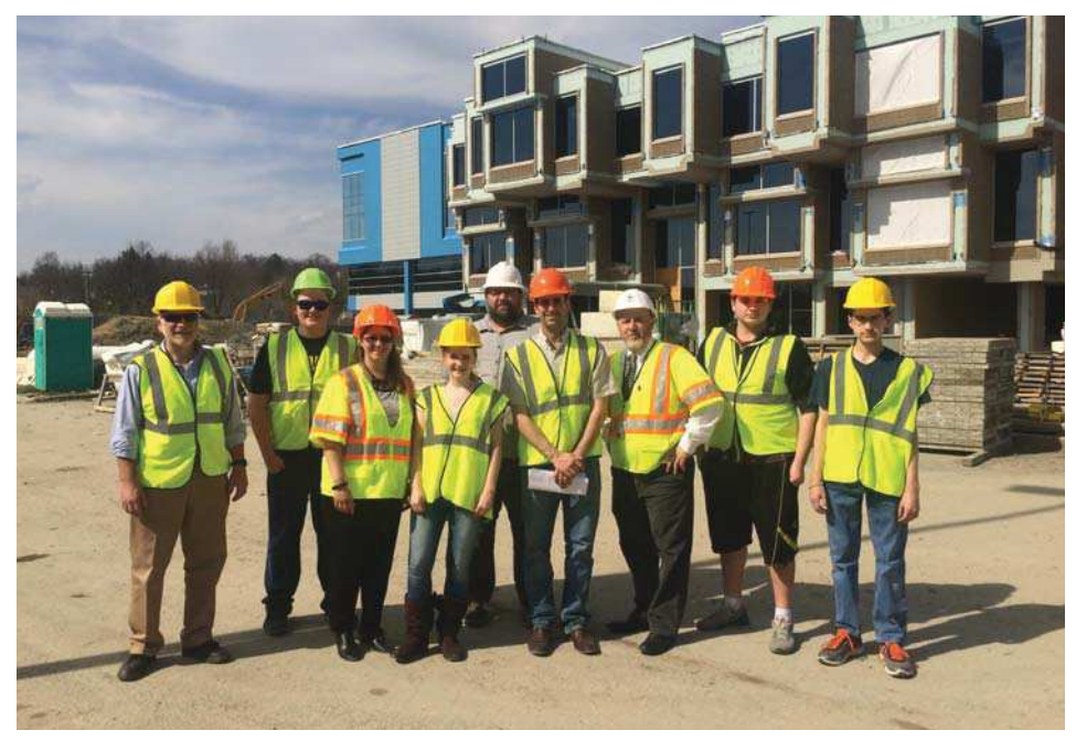
ACE students tour the Orange County Government Center

Students were also fortunate to tour two different construction projects in Newburgh; the renovation of a private residence led by Collier Construction, and the construction of a new fire station for Good Will Fire District led by CSArch and Meyer Contracting. Team Newburgh was also given an introduction to Revit tutorial, and were able to complete the design of their boathouse using this advanced digital modeling tool.