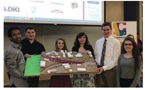
Team Middletown presents a model of their design proposal for the Heritage Walkway Trail