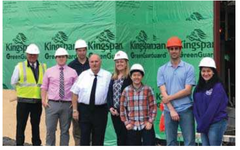
Construction tour of the new fire station for Good Will Fire District in Newburgh