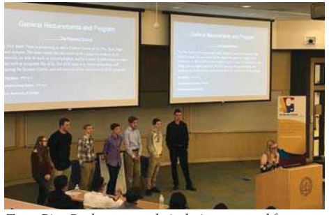
Team Pine Bush presents their design proposal for a new Student Center at the final presentation event

Equipment and met every other week to develop the project. Throughout the year, students learned about the roles of the many careers within the AEC industry. Starting from the ground up, students learned about different foundation styles and structural supports. Students developed floor plans and tried to determine the best layout based on how the spaces would be used. Team Pine Bush learned about space planning, engineering, zoning, estimating throughout the project. Interactive activities included a toothpick and gumdrop structure challenge. The last few weeks were spent exploring materials and products as well as learning the budgeting and estimating process.